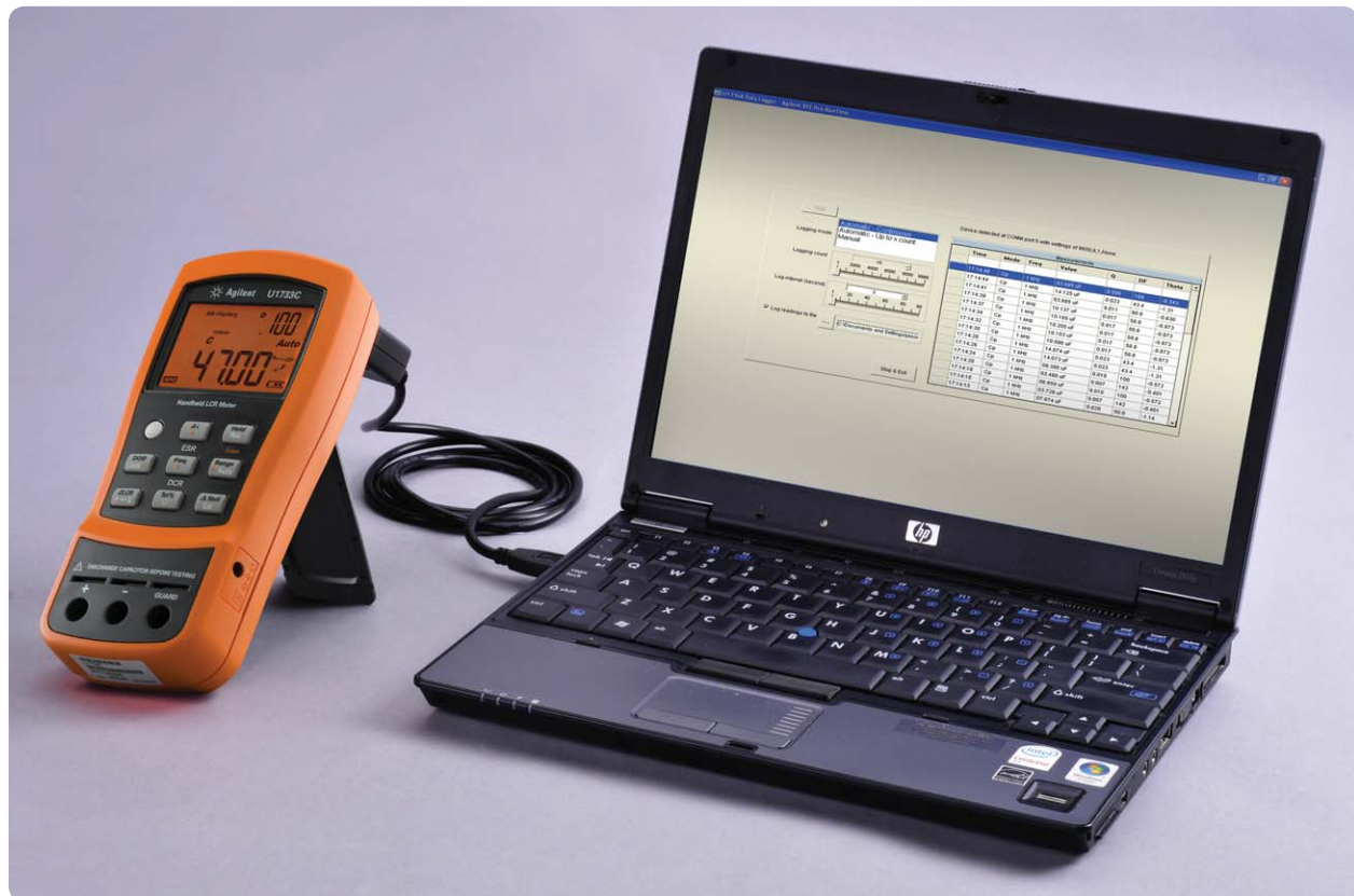
Figure 1. Automate the recording of continuous readings when you hook the U1731C/U1732C/U1733C to a PC

The handheld LCR meters allows you to test various component types, including secondary components of Dissipation Factor (D), Quality Factor (Q), and Angle Indication of Impedance ( \theta ). This new handheld series also includes other functions that result in a more detailed component analysis. For example, the built-in Equivalent Series Resistance (ESR) function helps you better understand the inherent resistance behavior typically found in capacitors across selected frequencies. DCR is a built-in DC resistance measurement that eliminates the use of a separate digital multimeter (DMM) for component test.